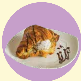
Warm Croissant with Gelato