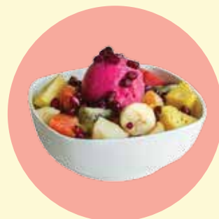
Fruit Salad with Gelato